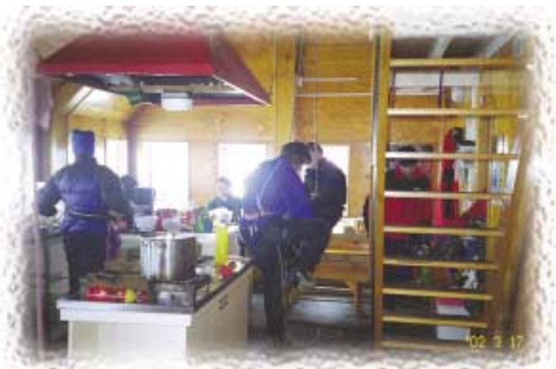
A typical hut bound blizzard day.

Help! It's finally got out and it's got me by the ankle!