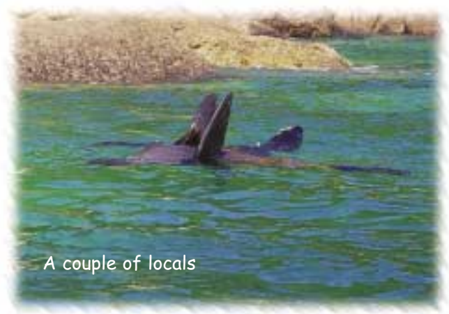
A couple of locals