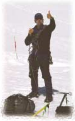
"Choice trip eh!"