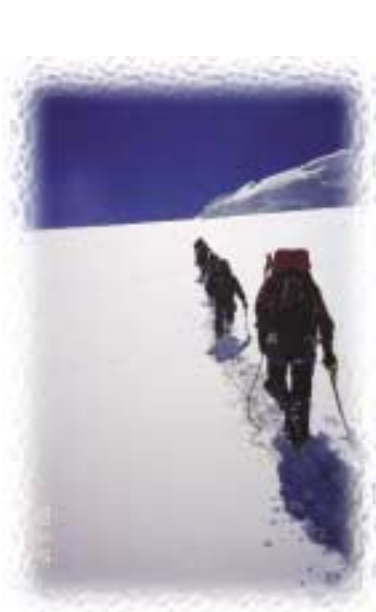
Onward and upward