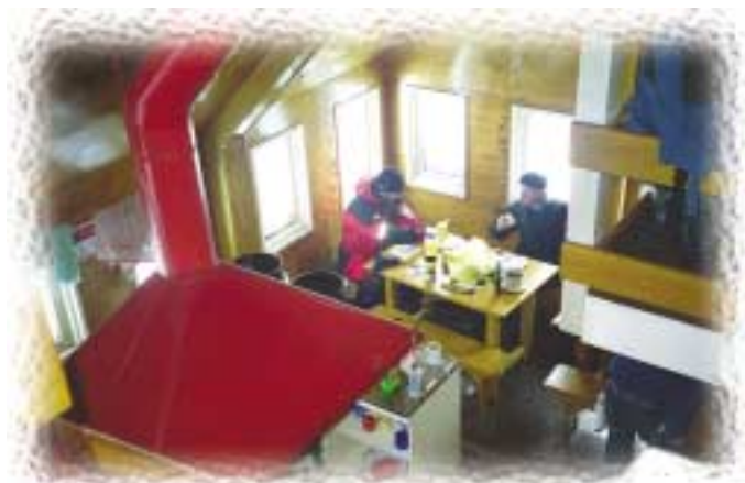
"More coffee?" "Why not, I've only had 12 today"