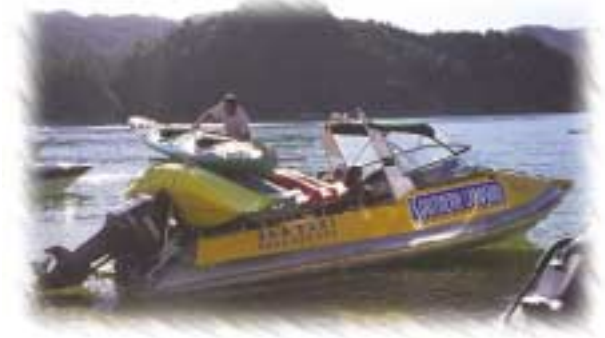
How to move a lot of kayaks