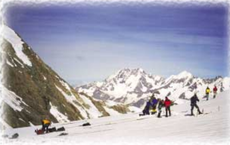
Building snow anchors. Mt Cook in the background.

Crampons on! This is where we all wanted to be! We trekked all over the place, visited Tasman Saddle Hut (Kelman rocks!!), set snow anchors and ice screws, weaved through crevasse fields, did self arresting (had to change undies after the hill moved!), ice climbed and crevasse rescued (more on that later!) We let Ash lead on one day, he has one speed, flat out!