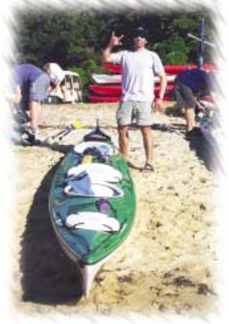
From mountain man to sea man!

We headed to the Able Tasman Marina Park where we headed out for a relaxing three day sea kayaking trip after our mountain adventure. A stunning place and popular kayaking destination.