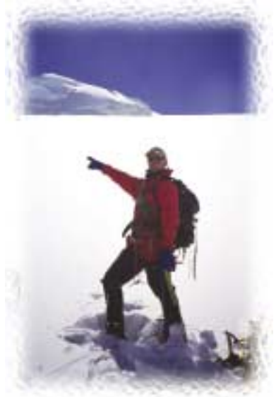
"I'm with idiot"