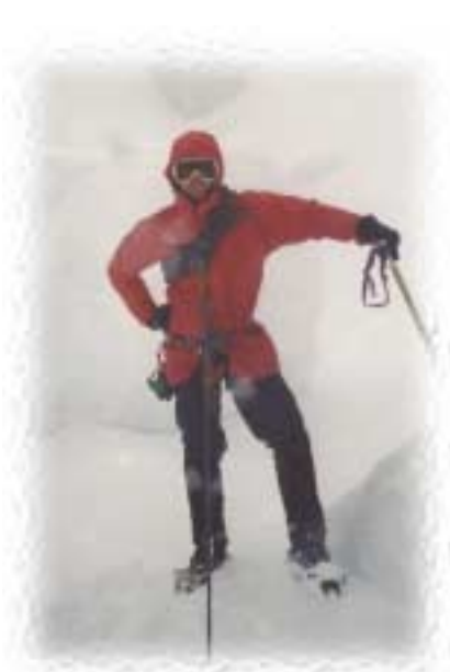
A typical mountain poser