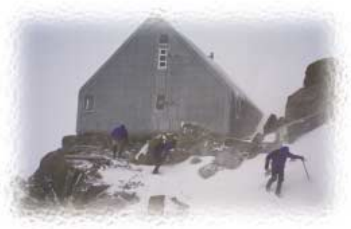
Kem and Jamie have just sent us out to do some blizzard navigation. "Go out and get lost, promise we'll find you".