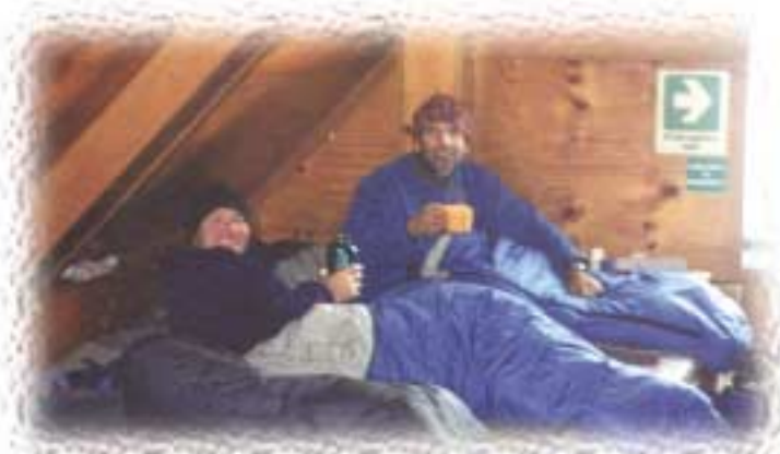
The best way to stay warm, Bourbon in a bag!