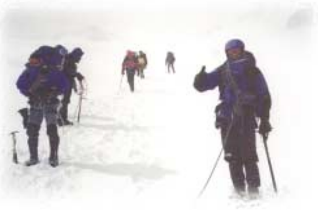
All roped up and not a whip anywhere!